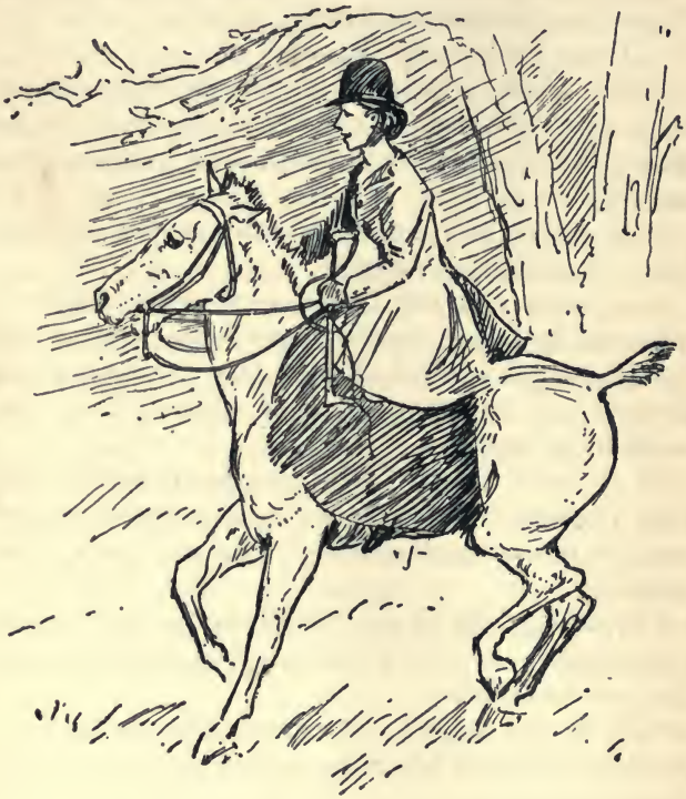
MISS SALLY AND THE COCKATOO MOVED AWAY

Sorcerer got his hind-legs under him, and